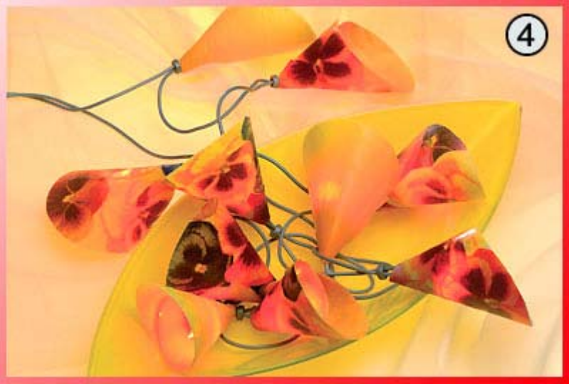
Assemble the lampshades and attach to a string of lights.